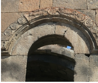
Fig. 8. Ptghni Church, 7th c., Armenia