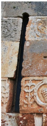
Fig. 19 Santa María de Quintanilla de las Viñas

In addition, there was a practice of building tall windows that can be called “slit” because of their insignificant width compared to their height, as in Quintanilla de las Viñas and San Pedro de la Nave. We can use the term “slit” for these windows because they are perceived almost as a split in the masonry fabric. Proportions of slit windows in the discussed four Spanish examples vary, the ratio of the width to the height ranges from 1:6.5 to 1:14. In San Pedro de la Nave slit windows have the ratio of 1:7 (fig. 20), in Quintanilla 1:14 (fig. 19). Slit windows in Quintanilla have semicircular crowning, whereas in San Pedro de la Nave the openings are of rectangular shape. The four slit windows of Quintanilla are built around the main apse, where excessive light is not necessary, whereas in San Pedro they are juxtaposed on northern and southern walls. In Armenian churches slit windows appear as well, the ratio of 1:5, and even 1:7 is possible, such as in the Saint Gevorg church in Garnahovit, thus providing prototypes for Visigothic slit window openings. In Syrian churches, to our knowledge, slit windows are not present.