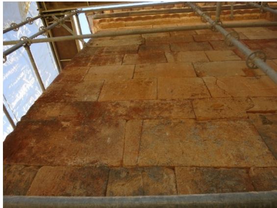
Fig. 6. San Pedro de la Nave, Spain

One of the features of Armenian buildings is the seamless look of the wall fabric, when seams between individual stone blocks are almost invisible (fig. 7). In Armenian architecture individual stone blocks can be distinguished only due to color differences of adjacent blocks. It was a common practice to use tufa blocks of different tones in the same building, as a result Armenian churches have a lively polychrome wall fabric. Toramanian emphasizes that the masonry with thin and invisible seams is a characteristically Armenian feature. 59 The observation of Visigothic structures shows that adjacent stone blocks are maximally adjusted to make the seam as thin as possible (fig. 6), providing another evidence for possible Armenian involvement in construction.