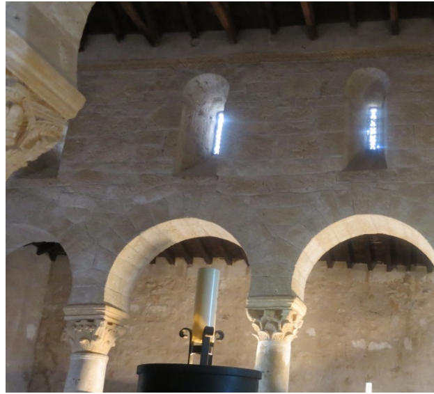
Fig. 22. Sprayed windows, San Juan de Banos, Spain

Sprayed windows of Santa María de Melque are combined with prominent horseshoe-shaped window crowning. Horseshoe window crowning is present in the 4th c. Kasakh church in Armenia, although not as prominent as in Melque. In 6th-7th c. Armenian churches, the horseshoe shaped window crowning is replaced with semicircular crowning.