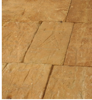
Fig. 9. A possible mason's mark, San Pedro de la Nave, Spain