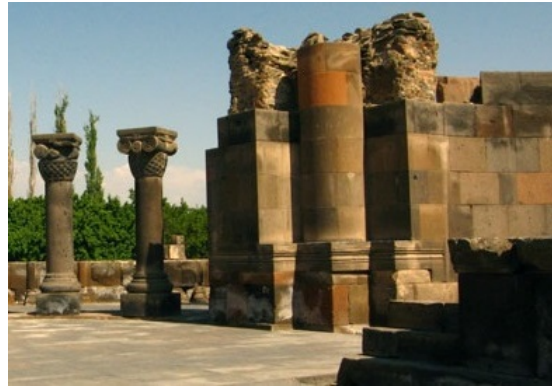
Fig. 5. Zvartnots Cathedral, 7th c., Armenia

It is worth noting that monolithic columns were also used in Armenian architecture, however, monolithic columns are less likely to withstand horizontal shocks resulting from earthquakes, and their use was abandoned because of their poor earthquake resistance.