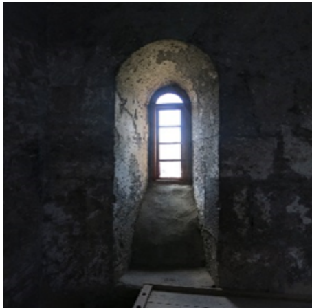
Fig. 21. Sprayed window, Mastara church, Armenia

that this feature of Visigothic fenestration has not been analyzed in research studies. That the sprayed form is a very strong evidence of Armenian-Spanish connections is attested by the fact that sprayed windows, to our knowledge, are unique to Armenian medieval architecture.