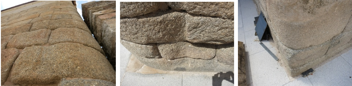
Fig 1. Santa María de Melque, groove Fig 2. Santa María de Melque, groove Fig 3. Santa María de Melque, rounding

Another feature that supports the likelihood of the vertical incisions dating to post-Islamic period is the fact that the rounding of the corners is made within the line of the wall, without any bulging or extending beyond the outline of the walls. If the incisions were made with the purpose of creating an impression of an attached column, it would be logical to extend the corners, go beyond the surface of the wall. In Melque, no such attempt was made, all rounding is “inscribed” within the boundaries of the walls.