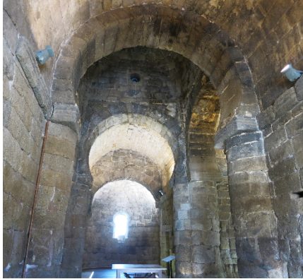
Fig. 4. Santa María de Melque, interior