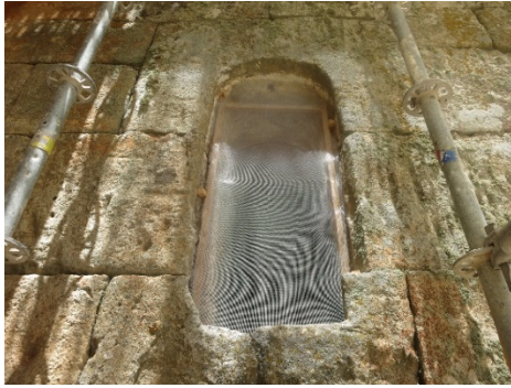
Fig. 16. San Pedro de la Nave, Spain

existing modes of construction. 66 The existence of very similar practices in two remote regions provides a strong evidence of possible direct connections.