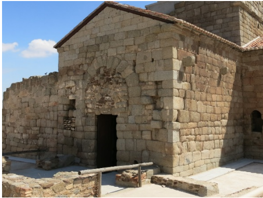
Fig. 14. Relieving arch, Santa Maria de Melque, Spain

as load-bearing elements to relieve the weight of the wall pressing on the entrance lintel. Relieving arches are used in the 5th c. Saint Mariam in Artik, and a number of 6th c. buildings, such as Saint Astvatsatsin of Avan (fig. 15), Saint Gevorg in Archovit, Saint Astvatsatsin of Dorbandivank, Saint Mariam in Nor-Kyank, and Saint Gevorg in Pemzashen. The relieving arch was replaced with a semicircular tympanum in the 7th c. Armenian architecture. The relieving arch is also present in Syrian architecture of pre-Muslim period, where it is often combined with a window centrally juxtaposed above the entrance lintel.