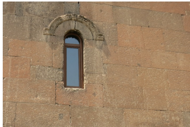
Fig. 7. Gayane Church, A. D. 630, Armenia

One other similarity is the manner in which arched openings are built. In 7th c. Visigothic structures voussoirs of arched openings are of irregular sizes and don't radiate correctly from the center. 60 In contrast, in Roman, as well as in Syrian architecture voussoirs display persistent regularity. Similar to Visigothic arches, in Armenian architecture voussoirs are of irregular sizes and in most cases don't radiate from the center. In smaller openings, the seam sometimes coincides with the central axis, almost completely rejecting the notion of the keystone (fig. 8). Examples can be seen in the windows of the Ptghni church, Talin Cathedral and the interior arches of the small church in Talin, all dating from the 7th c.