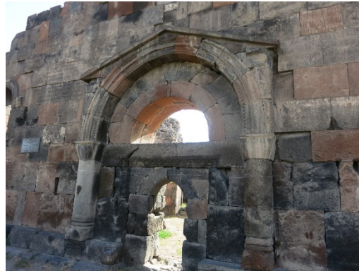
Fig. 15. Relieving arch, Avan Cathedral, A.D. 691, Armenia