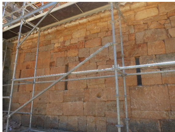
Fig. 20. San Pedro de la Nave