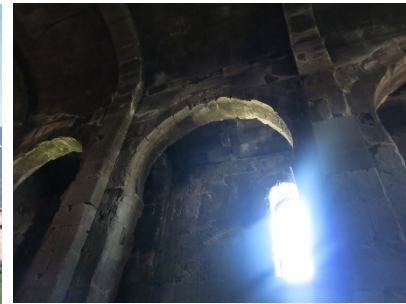
Fig. 13. Kasakh basilica, Armenia

Similarities are present in structural components. Many individual architectural elements appear in both Visigothic and Armenian buildings, including relieving arches, horseshoe shaped arches and apses, sprayed windows, “sinking” sills, single-stone crowning of windows, and bands of ornaments.