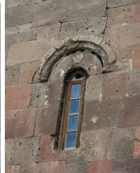
Fig. 18. Ptghni Church, Armenia

Window openings in both Spain and Armenia are not uniform in the same monument in terms of shape, size and proportions. Although semicircular window crowning is common, rectangular shape of windows appears in both regions. It is not uncommon to have both types of window openings in the same monument. In San Pedro de la Nave both forms are present, numerous Armenian churches have both types of windows.