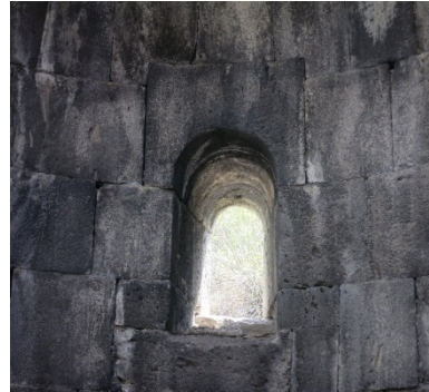
Fig. 17. Bayburd Church, Armenia