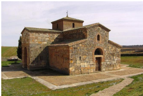
Fig. 11. San Pedro de la Nave, Spain

Majority of Armenian churches have a rectangular exterior, four gabled roofs on four cardinal directions, and entrance openings aligned with gables. In most cases, on southern and northern facades, a second, lower, slope is present (fig. 12). This type of volumetric arrangement creates an impression of a cruciform roofing. A very similar type of spatial arrangement is present in Visigothic churches, particularly in San Pedro de la Nave (fig. 11).