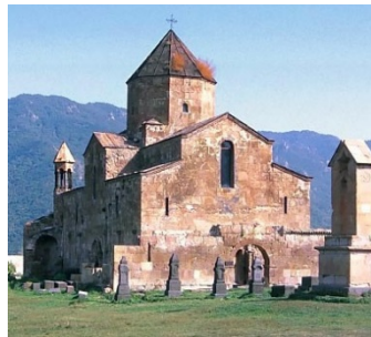
Fig. 12. Odzun Cathedral, Armenia